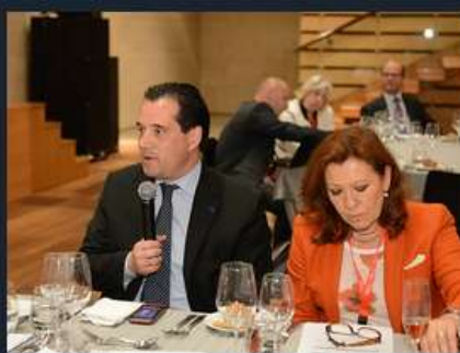
Working Lunch European Priority