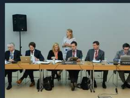
eHealth Network Closed Meeting