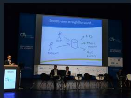
Rare Diseases infoways