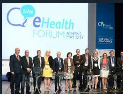
European Patient Summaries