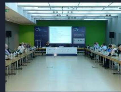
Monday's Various Sessions