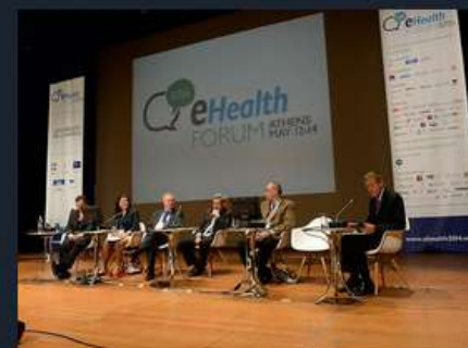
High Level Debate on integrate...