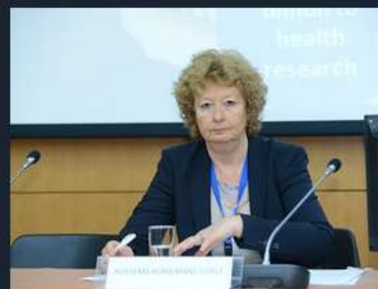
H2020 - Personalising Healthcare