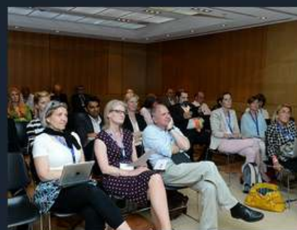
EIP on AHA - Various sessions