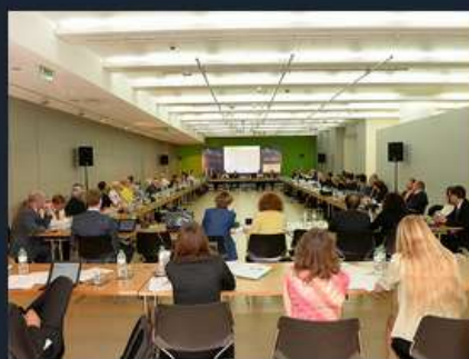
Tuesday's Various Sessions