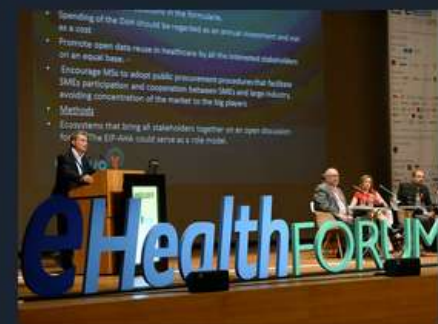
Closing Session 'Give Health a...