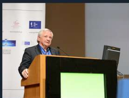
EU-US MoU on eHealth Plenary