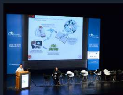
eHealth for resource limited settings