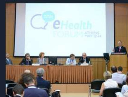
Big Data for Healthcare Reform