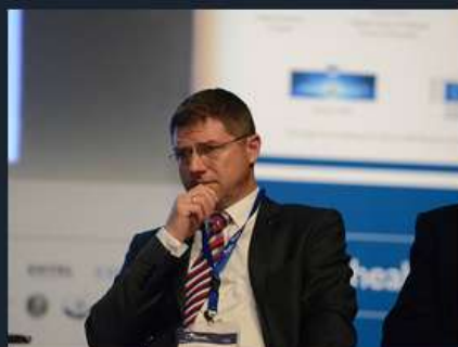
eHealth Deployment & Service...