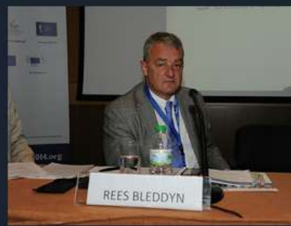
EIP AHA - ECHAlliance for Innovation