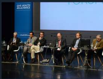
Healthcare without borders