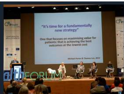
From Strategies to Services