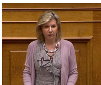
Ms Zetta Makri Deputy Minister of Health, Greece