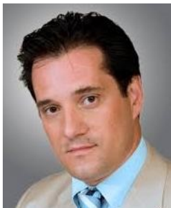
Mr Adonis Georgiadis EU Hellenic Presidency, Minister of Health, Greece